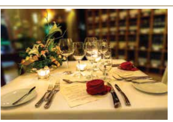
Price is subject to a 10% service charge and 7% government tax. Reservations in advance are required.